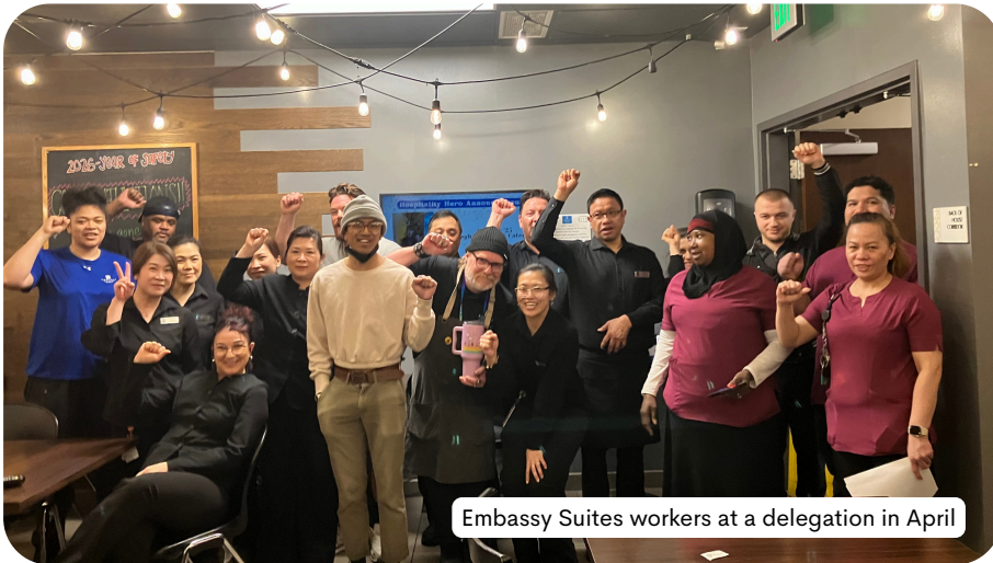
Embassy Suites workers at a delegation in April

“We won strong raises in our last contract, but management responded by cutting hours while pushing more work onto fewer people. This has left my coworkers and I more physically and mentally exhausted, while the cost of basic necessities like rent and groceries continues to rise.