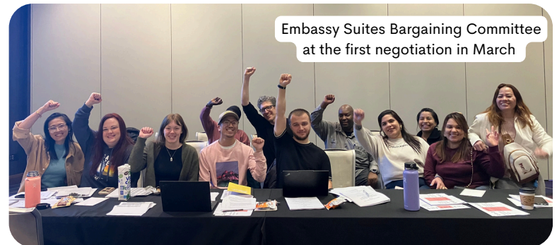
Embassy Suites Bargaining Committee at the first negotiation in March