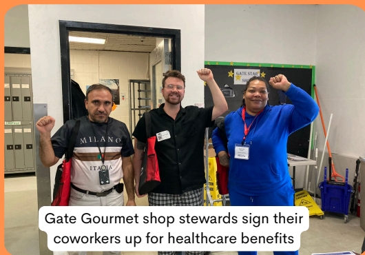
Gate Gourmet shop stewards sign their coworkers up for healthcare benefits

I'm so happy that my coworkers and I finally have access to quality, affordable healthcare. We'll be able to get the treatment we need without worrying about paying a deductible or paying a big bill that comes in the mail.